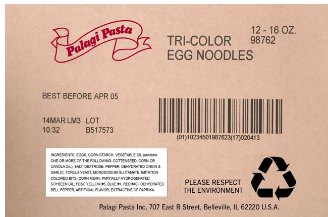
Pre-printed logos and company data. Label with ingredient listing. Variable information printed in-line with inkjet printer.

Unlike pre-printed cases, inline coding provides enormous flexibility. Messages are quickly changed, and new messages can be created and stored for immediate or future use. The printers are very compact and take up minimal space on the production line. They can print logos, graphics, large and small text, and a wide range of linear and 2D bar codes, including the increasingly popular GS1-128 bar code. State-of-the-art printers feature the ability to automatically purge ink through the printhead before every print, ridding it of contaminants to provide consistently clear, high-resolution codes.