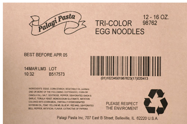
All information printed in-line with multiple high-resolution inkjet printers.