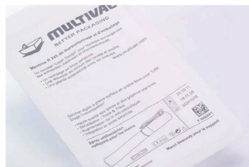
Medical Device package with Tyvek® lidding