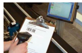
Job data can be sent to the printer via a hand-held scanner

Ask your Videojet representative for more guidance, a production line audit or sample testing on your substrate.