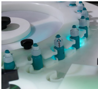
Star wheel transport for positive bottle control during marking