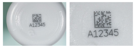
High contrast UV laser mark on HDPE bottle