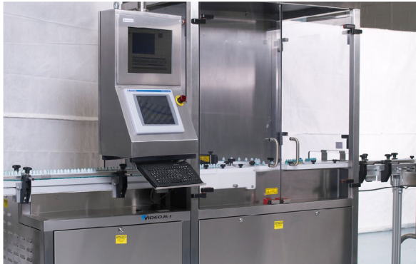
FP Developments packaging solution including Videojet UV laser installation

Videojet worked closely with FP Developments to ensure the proper integration of the UV lasers into their packaging equipment. With over 50 years of packaging machinery design experience, FP Developments created a solution that provided very smooth material handling, a prerequisite for marking high quality DataMatrix codes at the specified line throughput. In addition, the Videojet UV laser software included arc compensation as a standard feature. This software feature further increased the DataMatrix code quality by compensating for the trajectory of the product on the rotary material handling device (star wheel). Operational and coding requirements vary among companies, so the ability to easily tailor the system to meet these needs is critical. User-defined parameters and set up options help companies easily achieve their individual level of code detection.