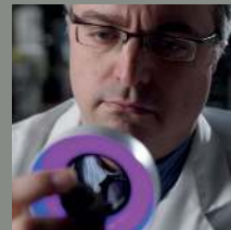
V459-D UV ink on glass vial bottom

Working closely with Bausch+Ströbel, Videojet proposed the 1510 Continuous Ink Jet printer with 70 micron nozzle and V459-D ultraviolet fluorescing ink. Videojet V459-D ultraviolet ink was selected since it addressed a number of application requirements including high fluorescence, outstanding edge acuity on plastic and glass surfaces, and excellent adhesion and resistance to autoclave processing. The Bausch + Ströbel solution includes an integrated inspection station to provide further assurance of code quality.